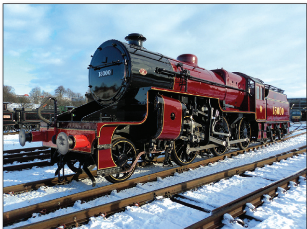
London Midland & Scottish Railway “Crab” in its new guise as 13000 was rolled out in December 2010 after a repaint and conservation and is good enough to use as a Christmas card!