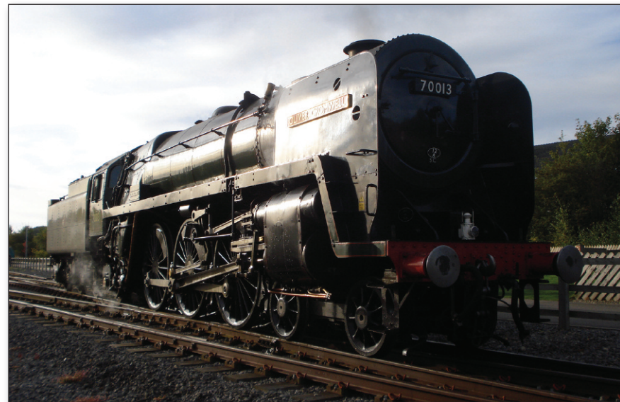
Thousands came to the 2009 Steam Gala to see “Oliver Cromwell” which had arrived off the main line. The National Collection engine took part in a photo session at Locomotion on the Sunday morning as seen here.