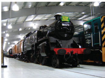
The NRM has good relationships with many heritage railways including the Severn Valley Railway, who lent Standard 4 Class No. 80079 for display in Spring 2005.