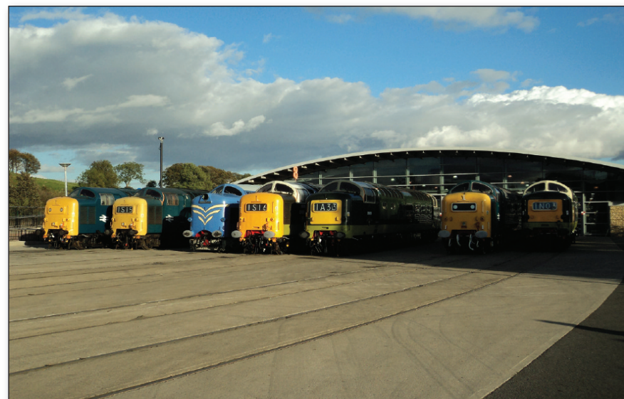
50 years of Deltic locomotives was celebrated on 7-8 October 2011 with a gathering of all 7 surviving locomotives including the Prototype Deltic from 1955.